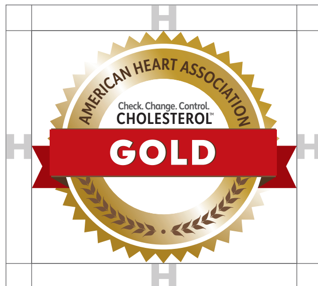
Safe zone: the “H” above, which is the cap height of word in banner